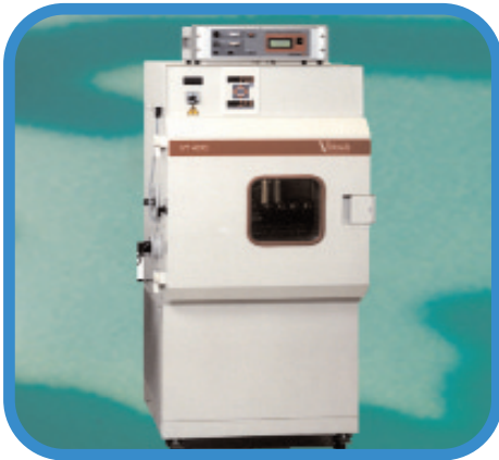
HG-10 Humidity Calibrator

A fully automated, turnkey humidity and temperature test and calibration system with profiling capability