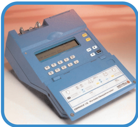
Cermax IS Portable Dewpointmeter

The hygrometer of choice for the measurement of dew-point temperature or moisture content in hazardous area gas applications