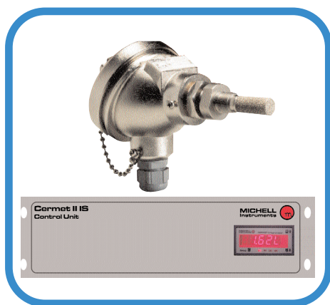
Cermet II IS Hygrometer

For continuous dew point measurements in hazardous areas with safe area display, Cermet II IS is the ideal on-line hygrometer solution with full certification by ATEX, FM and CSA